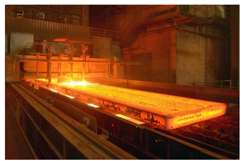
Fig. 1. Steelworks of Liberty Częstochowa Sp. z o. o.

The Steelworks of Liberty Częstochowa Sp. z o.o. produces semi-finished products for hot processing. The production range includes: non-alloyed, low-alloyed and alloyed steel slabs and blooms delivered in "as cast" condition. The semi-finished products are made in production routes: Electric Arc Furnace (EAF), secondary metallurgy (LF/VD/VOD), Continuous Casting (CCM).